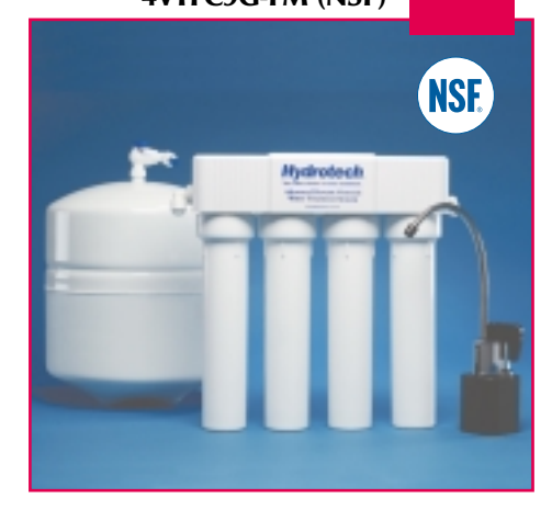
Models 4VTFC45G-PB (NSF) 4VTFC25G-PB (NSF) 4VTFC9G-PB (NSF)

Models 4VTFC45G-FM (NSF) 4VTFC25G-FM (NSF) 4VTFC9G-FM (NSF)